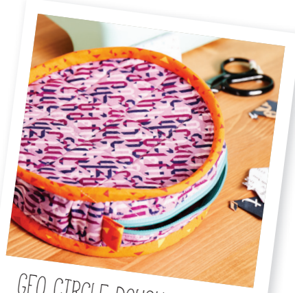
GEO CIRCLE POUCH PAGE 69