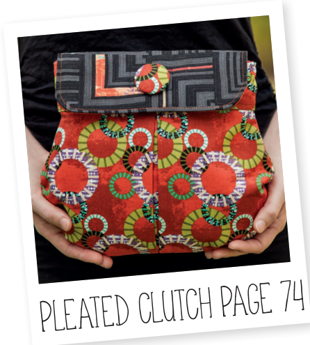
PLEATED CLUTCH PAGE 74